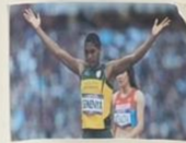
Caster Semenya Athletics (800 meters sprint) Africa / South Africa gold