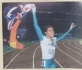
Cathy Freeman Athletics (400 meters sprint) Australia gold