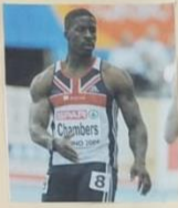
Dwain Chambers Athletics (sprinter 100 meters) United Kingdom silver