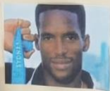
Bolton St Athletics (100/200 meters) sprinter) Trinidad and Tobago gold